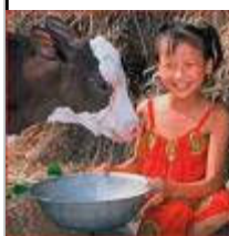
Girl likes cow

Your donation buys a farm animal for an impoverished family, and Heifer International also provides follow-up educational support so that the family learns how to take care of the animal and put it to good use (as opposed to eating it the next day). They have animals for all budgets: a cow is like $200, but a goat is $100 and a pair of rabbits will run you $25. Or you can donate a llama, because they're just cool. They also have breeding programs in place so that