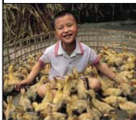
Boy likes ducks

Your donation buys a farm animal for an impoverished family, and Heifer International also provides follow-up educational support so that the family learns how to take care of the animal and put it to good use (as opposed to eating it the next day). They have animals for all budgets: a cow is like $200, but a goat is $100 and a pair of rabbits will run you $25. Or you can donate a llama, because they're just cool. They also have breeding programs in place so that